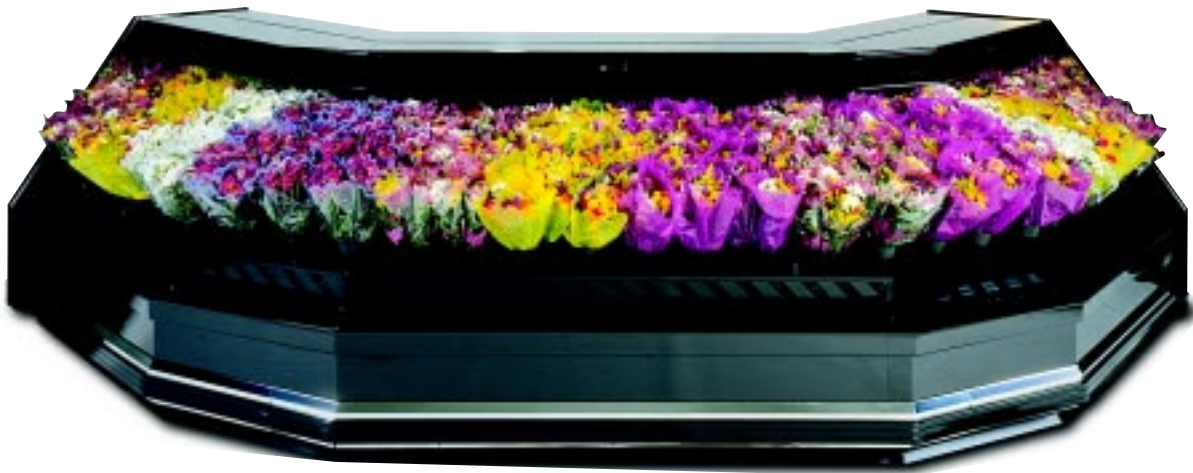
MP6 shown with MP4-45° left and right-corner wedge